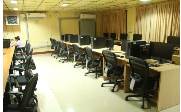
Remote sensing and GIS