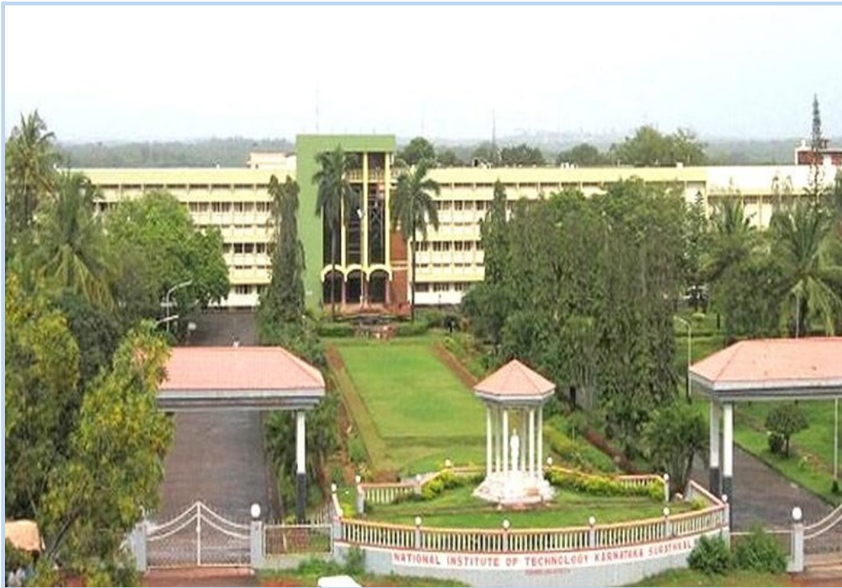
National Institute of Technology Karnataka, Surathkal, Mangaluru, Karnataka