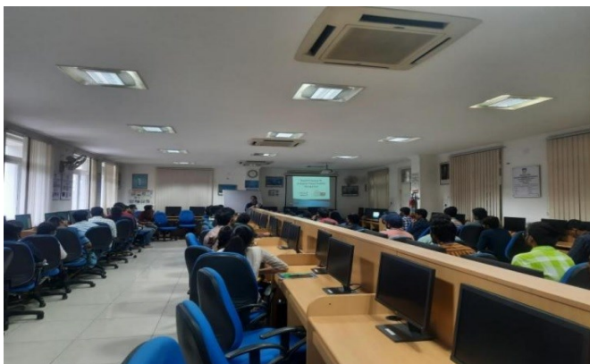
Remote Sensing and GIS Lab