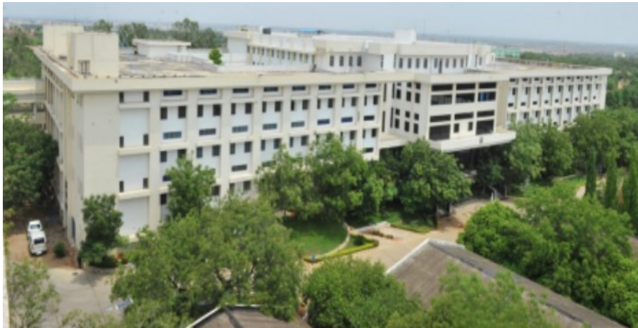
VNR Vignana Jyothi Institute of Engineering and Technology, Hyderabad, Telangana

The department has well qualified and experienced faculty (19 Ph.D.'s in various specializations of Civil Engineering) with an average teaching experience of 9 years. The faculty of department published 270 papers in various International / National Journals and Conferences in the last 5 years. Department has MoU's with Industry and also undertake consultancy to promote Industry Institute Interaction. The Department is offering consultancy services to GHMC and more than 30 private agencies every year and generated Rs. 150 Lakhs in last 7 years. The research grant of Rs. 76.1 Lakhs has been received under different research schemes namely SERB, CRG, ISRO, TEQUIP-II, DST, RPS etc and FDPs also sponsored by RPS, AICTE & UGC. The Department is actively involved in organizing seminars/Conferences/Workshops for Professional interaction to keep abreast with the latest developments in the field of Civil Engineering.