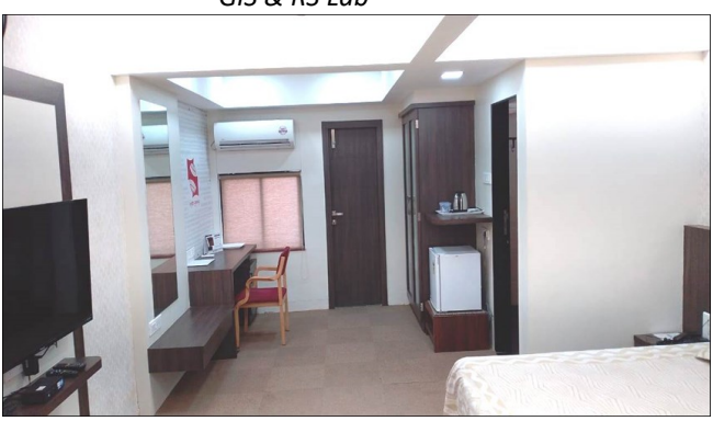
Guest House Room