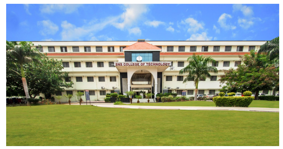
Fig 1. SNS Institutions, Coimbatore, Tamil Nadu

The Department offers B.E. Civil Engineering degree programme and M.E. Structural Engineering programme. The undergraduate programme (B.E.) in Civil Engineering was started in the year 2009-10 with a sanctioned intake of 72. Based on its expertise, the department was permitted to offer a graduate programme (M.E.) in Structural Engineering from 2013-14 onwards with a sanctioned intake of 18 students. Considering the ever-growing demand of Civil Engineers and growing emphasis on planning, a new and unique undergraduate programme, B.E – Civil Engineering and Planning was introduced from the year 2016-17 onwards.