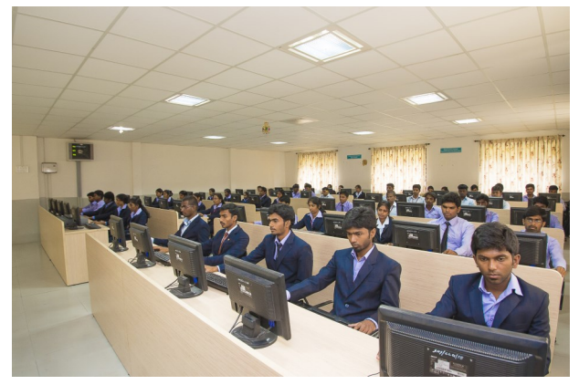
Fig 3. GIS and Remote