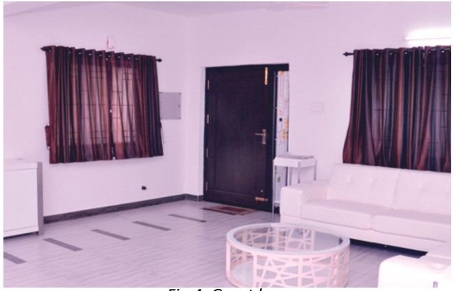
Fig 4. Guest house