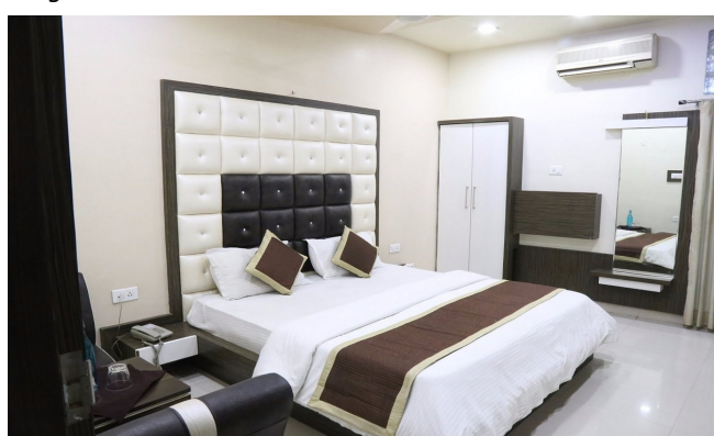
Guest House Room